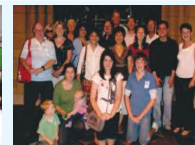
RCIA Confirmed Candidates and their Sponsors