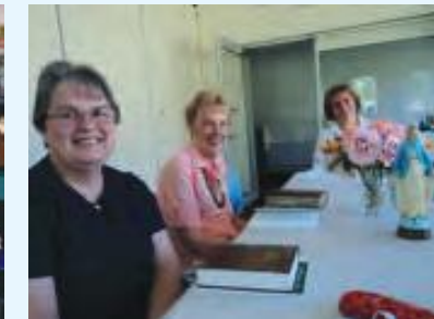
The Bible Study Group