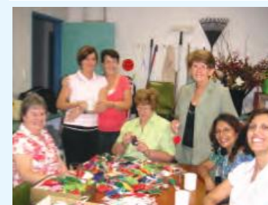
The Craft Group