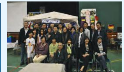
Multicultural Food Night