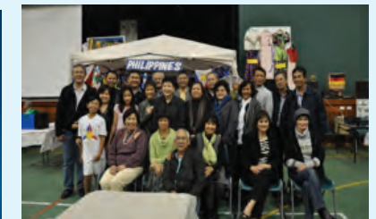
Multicultural Food Night