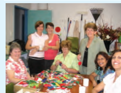
The Craft Group