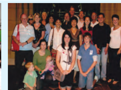
RCIA Confirmed Candidates and their Sponsors