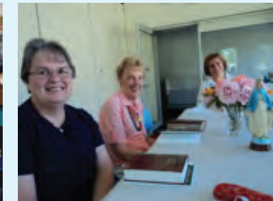
The Bible Study Group